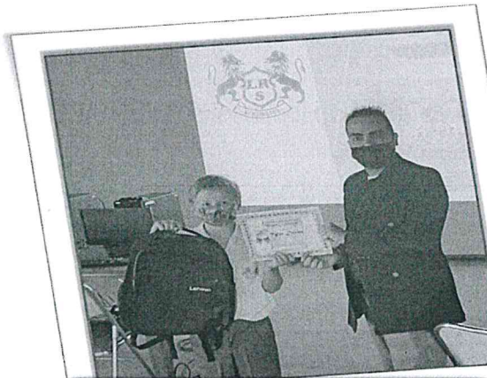
LRS GAMING CHALLENGE -3RD PLACE