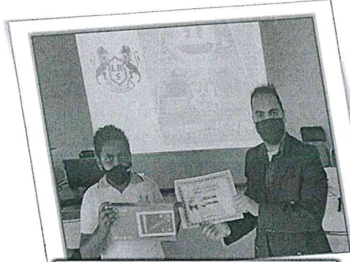
LRS GAMING CHALLENGE -1ST PLACE