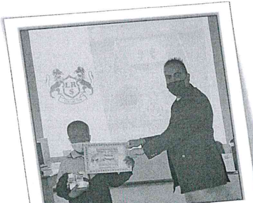
LRS GAMING CHALLENGE -2ND PLACE