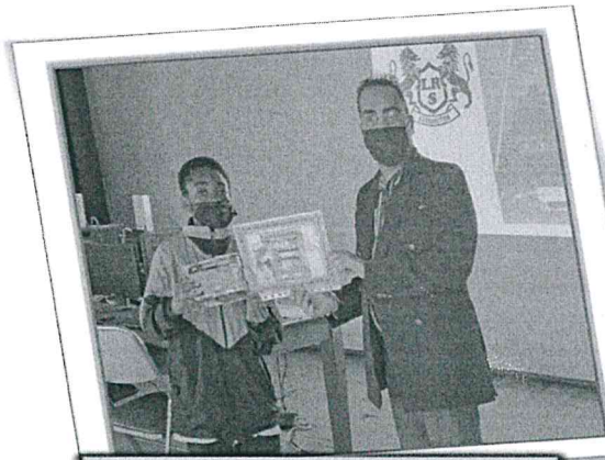
LRS GAMING CHALLENGE -2ND PLACE