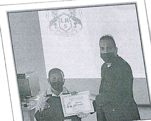
LRS GAMING CHALLENGE -3RD PLACE